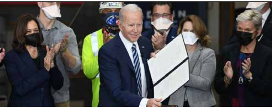
President Joe Biden and Vice-President Kamala Harris traveled to the headquarters of United Steel Workers, Local 5, for the signing of an Executive Order requiring the use of Project Labor Agreements on all federally funded projects of more than $35 million.